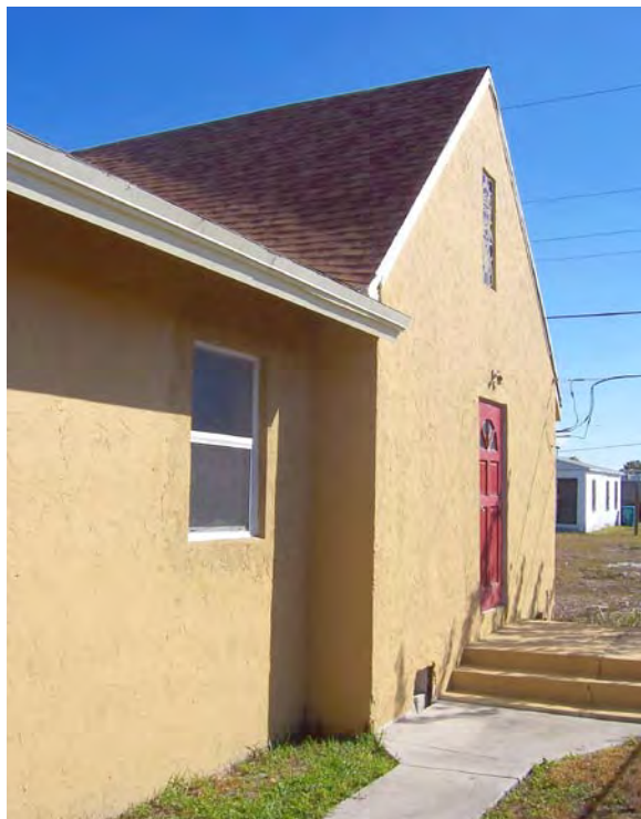
The rear portion of the church was the original building built in 1926. A stained-glass window [here shown above the door] adorns each end of the old section.