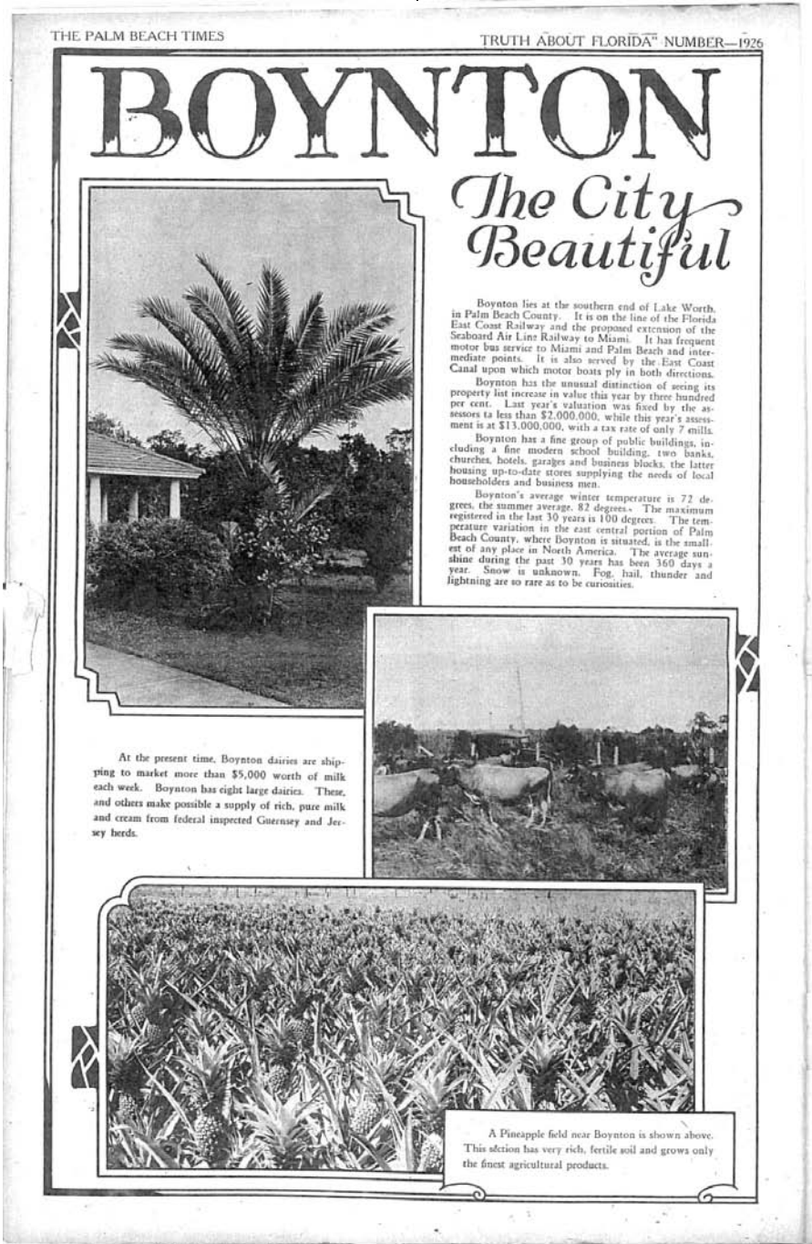
A page from the Palm Beach Times 1926 promoting the desirable qualities of "Boynton, The City Beautiful."