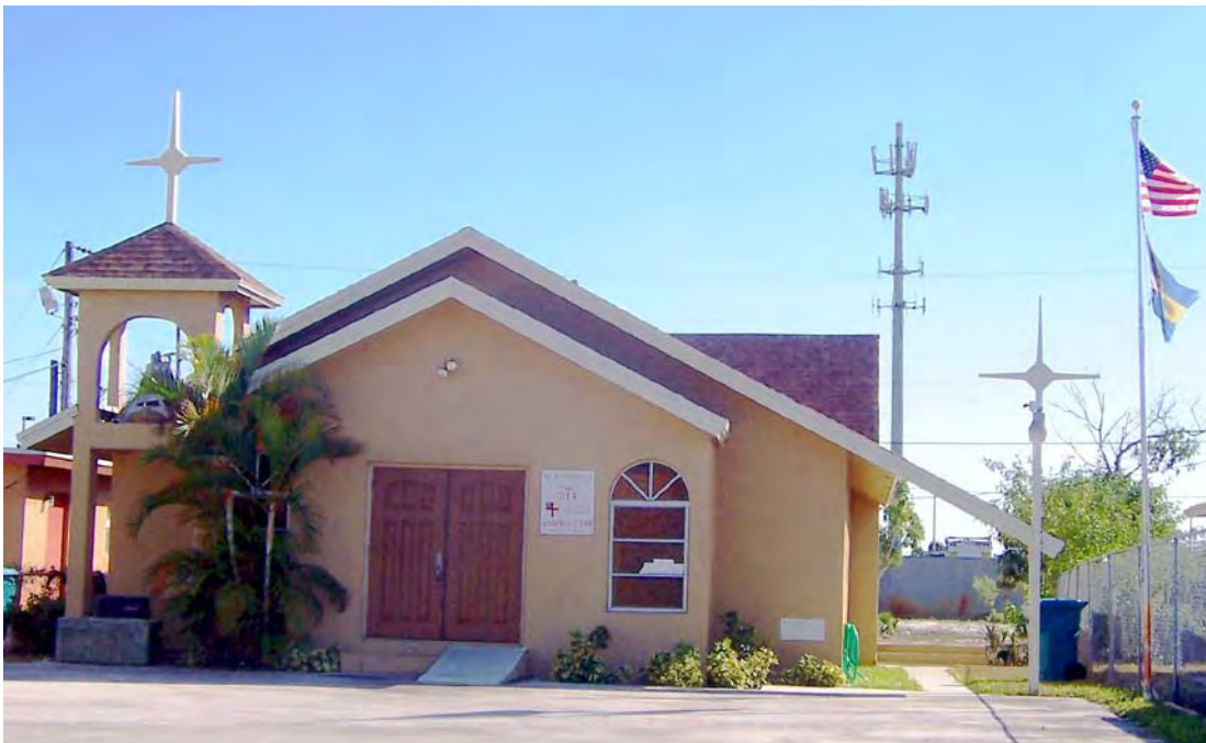
St. Cuthbert's Episcopal Church, Boynton Beach 2000. Note the Bahamian flag on the flagstaff. More photos p.3