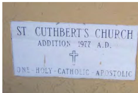
A cornerstone marks the 1977 addition.