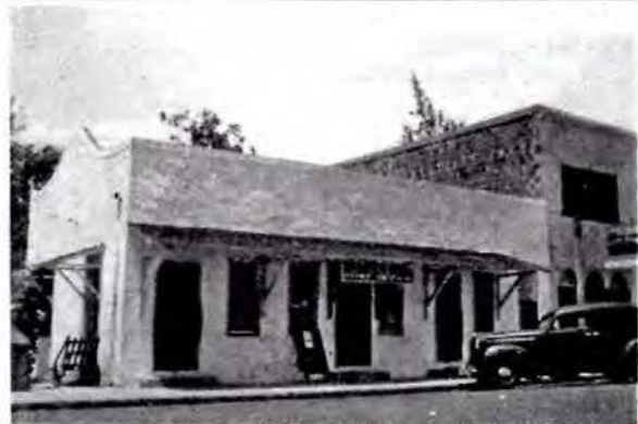
Boynton Post Office on Ocean Avenue, Circa 1940