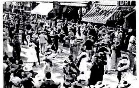
Street Dance on Clematis Street., West Palm Beach, FL circa 1920

Other pages, not included here, indicate whether the registrants had receipts to prove they had paid the required poll tax. Voters were usually asked also to pass non-standardized literacy tests, and only whites were permitted to vote in the Democratic White Primary which existed until outlawed by the U.S. Supreme Court in 1944.