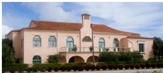
Boynton Woman's Club