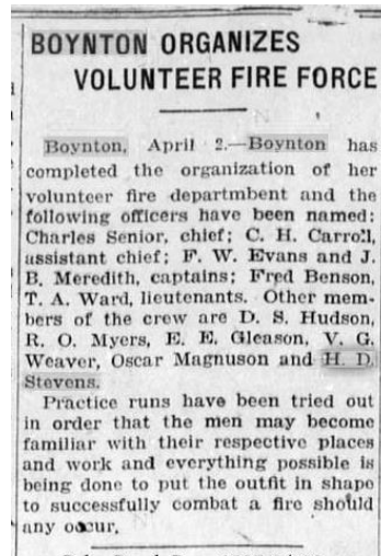
Palm Beach Post, 1925-04-03