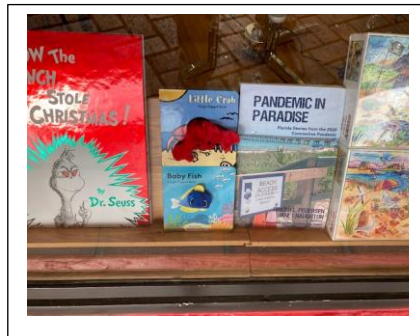
Window display at Hand's