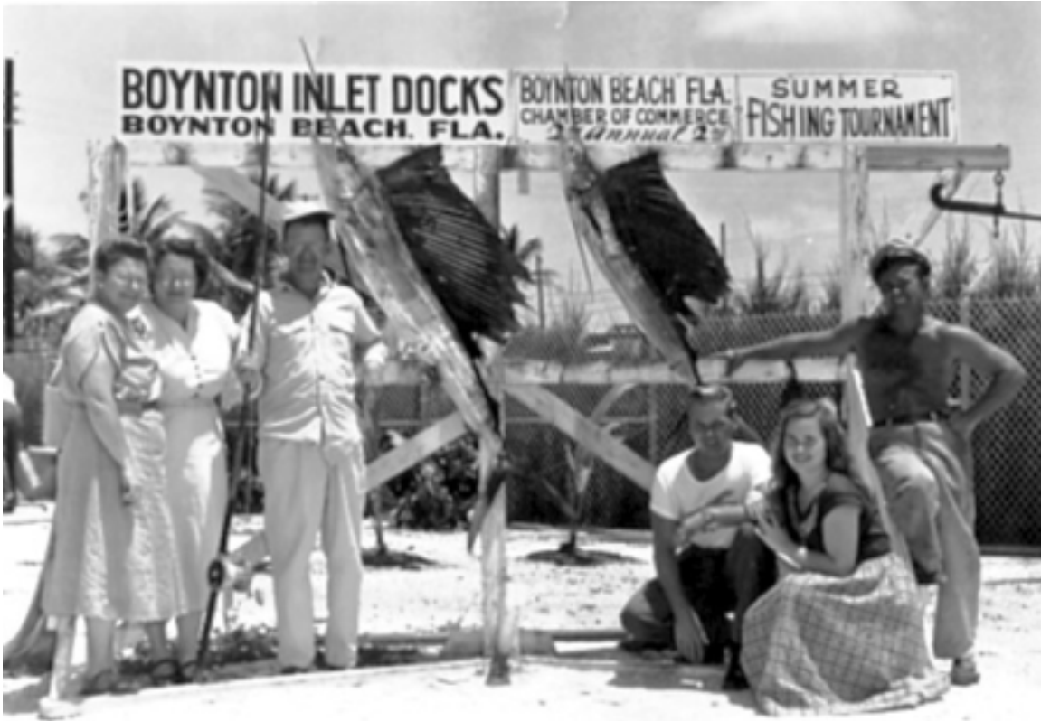
Boynton Inlet Docks – Very Late 1940s