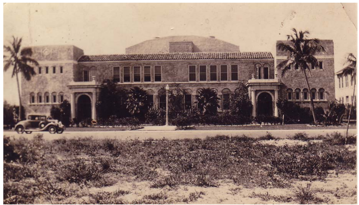
1927 Boynton High School (photographed in early 1930s)