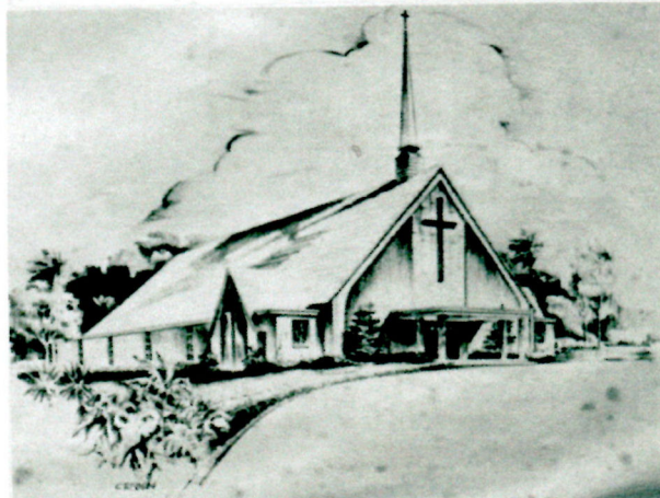
DREAM OF 300 MEMBERS FAST BECOMING A REALITY ...Ground-breaking ceremony to be held on site of new Presbyterian Church Sunday

The public is cordially invited to attend groundbreaking ceremonies and the morning worship service which follows at 10:30.