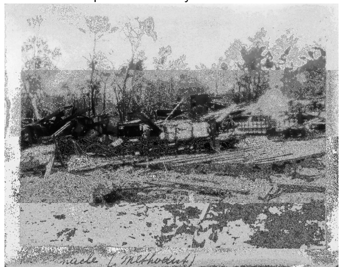
Methodist Tabernacle destroyed by hurricane of 1928 (On site where current First United Methodist Church stands.)

If you have no stories, come anyway. You will leave with a new respect for the fury of nature.