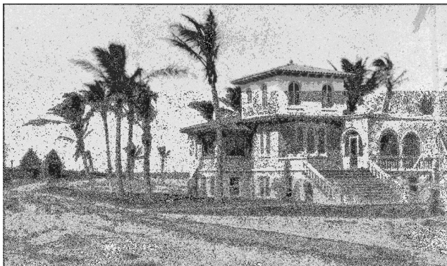
Miller House before 1947 hurricane