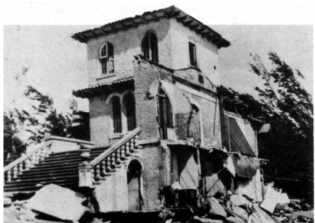
Miller House after 1947 hurricane