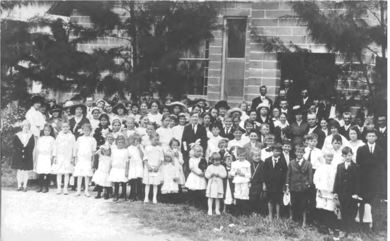
A Boynton Methodist Sunday School group probably photographed between 1909 and 1911 near the time Palm Beach County was created. The block building in the background is the Boynton Methodist Church built in 1908 at the corner of Federal Hwy and Ocean Avenue.

THE HISTORIAN P. O. Box 12 Boynton Beach, FL 33425-0012