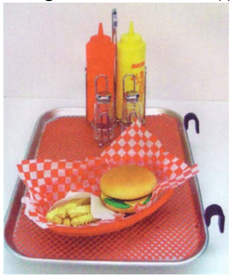
Car Hop Tray

Long before Sonic, local drive-in restaurants were popular teen hang-outs. In the 1930s, 40s and 50s no restaurants were air-conditioned, and eating outdoors, especially in our year-round warm Florida weather, was appealing. The service area was often unpaved, as this picture shows, and the only communication with the kitchen was through the "car-hop" [server] who took the customer order while the patron remained seated in the car. When the order had been prepared, the server carried it out to the open car window and attached it by a special tray which hooked over the window frame and had a folding brace which rested against the car door for support.