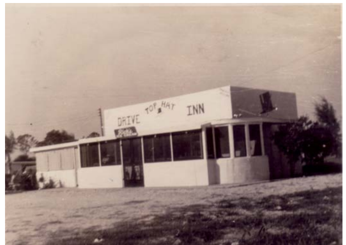
Top Hat Drive-In Restaurant, Federal Highway, Late 1940s

Long before Sonic, local drive-in restaurants were popular teen hang-outs. In the 1930s, 40s and 50s no restaurants were air-conditioned, and eating outdoors, especially in our year-round warm Florida weather, was appealing. The service area was often unpaved, as this picture shows, and the only communication with the kitchen was through the "car-hop" [server] who took the customer order while the patron remained seated in the car. When the order had been prepared, the server carried it out to the open car window and attached it by a special tray which hooked over the window frame and had a folding brace which rested against the car door for support.