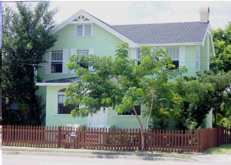
This was originally known as the Bowen House and is also located on South Seacrest Boulevard immediately north of the Ward House. This photo was taken in 2006.