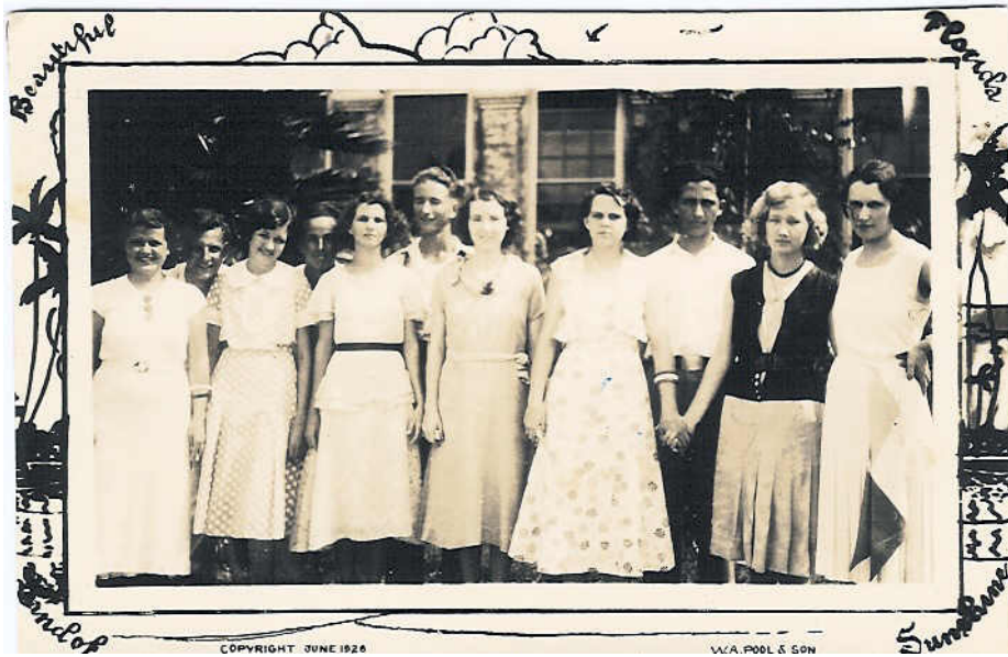
Boynton High School Seniors 1934