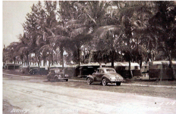
A Briny Breezes street in 1939 is quite a contrast to a street in 2006 shown on page 1.

Briny Breezes is a 43-acre town with 600 feet of oceanfront and 1,100 feet along the Intracoastal Waterway. On January 10, 2007 the residents voted to approve the sale of the entire community for $510 million. The sale is scheduled for completion in 2009, but the Towns of Gulf Stream to the south and Ocean Ridge to the north have expressed concern about the projected construction plans, population density, and increased traffic flow. Boynton Beach which supplies water and waste removal is also concerned about the impact. Completion of development plans will depend on decisions by Palm Beach County and the State both of whom will listen to and be influenced by what the three municipalities mentioned above may have to say.