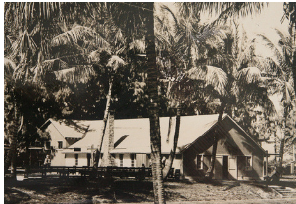
Briny Breezes Clubhouse 1955.