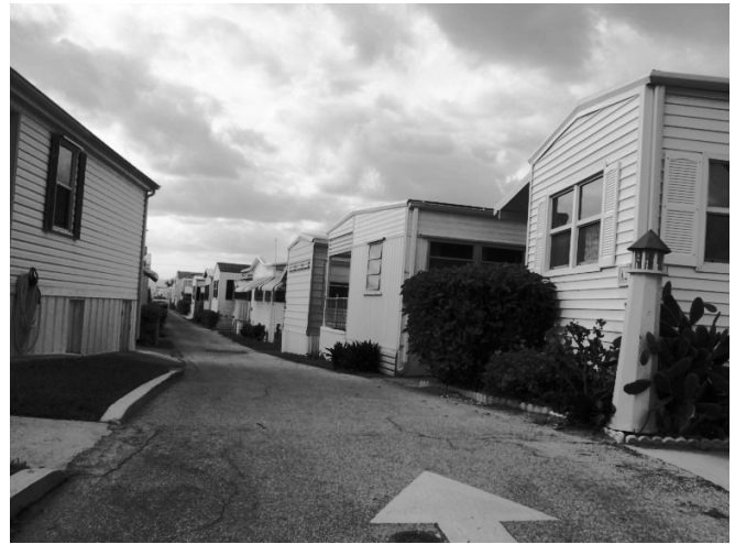
A street in the Town of Briny Breezes

All programs of the Boynton Beach Historical Society are OPEN and FREE to the General Public. For more information e-mail us at boyntonhistory06@yahoo.com or call us at 561-742-6397.