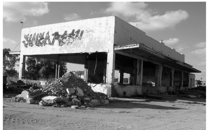
Seaboard Coast Line Station