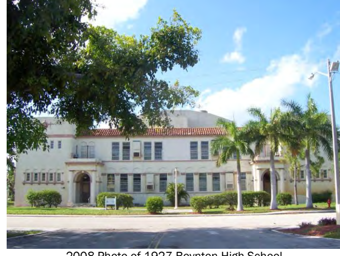
2008 Photo of 1927 Boynton High School

On October 7 the City Commission voted to return the 1927 historic old high school to the control of the City Commission. They had given it to the CRA in 2006 to include in its plans for redevelopment of the old downtown area of Boynton. A study commissioned by the CRA had recommended that it be refurbished into a public building as a pivotal point in redevelopment. Unfortunately, the CRA was unable to reach an agreement with a contractor for the building's restoration. You may remember the Commissioners dismissed the citizen makeup of the CRA several months ago and took it over themselves.