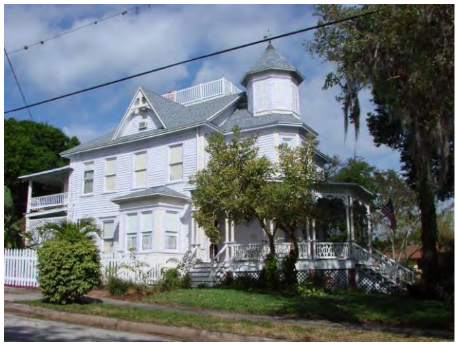
William H. Gleason House in Melbourne, FL U.S. National Register of Historic Places