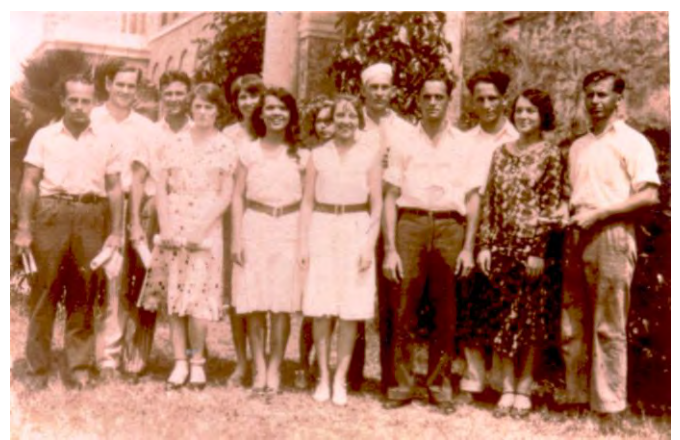
Class of 1931