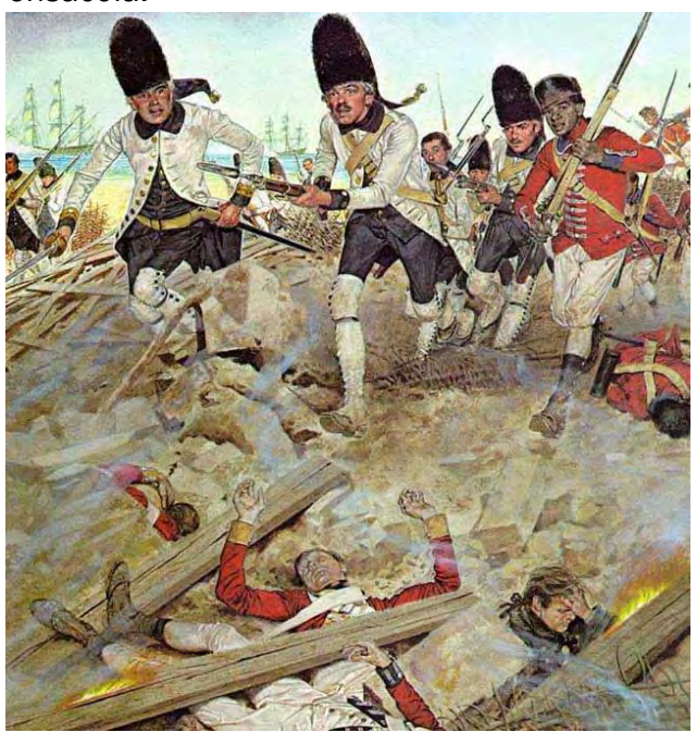
Spanish Troops Conquer Pensacola in 1781

The Spanish were not through, however, and late in 1781 while the British were preoccupied with the American Revolution, the Spanish captured West Florida in the Battle of Pensacola.