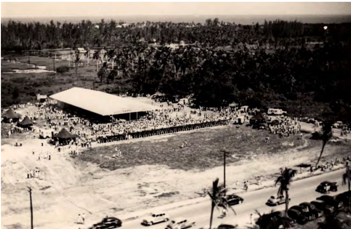
Farmers' Market, early 1940s, located approximately where St. Marks Church is today.