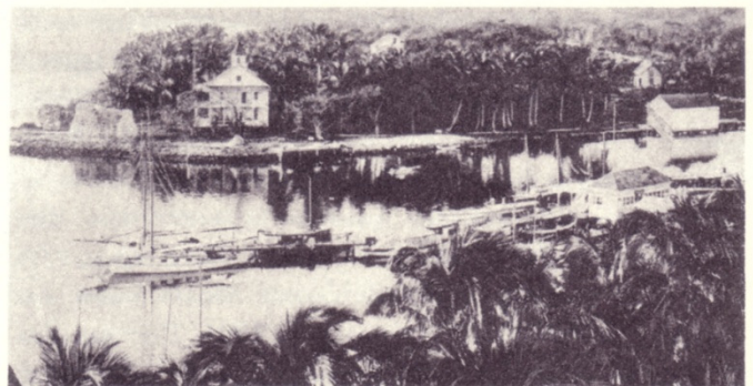
Miami ca. 1900.

"The hack line was also short-lived. The Florida East Coast Railroad arrived in West Palm Beach in 1894 and in Miami in 1896. The Intracoastal Waterway was completed to Miami in the middle 1890s.