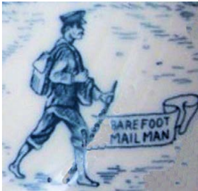
The Barefoot Mailman as depicted on the Boynton Beach Historical Society's Centennial Plate