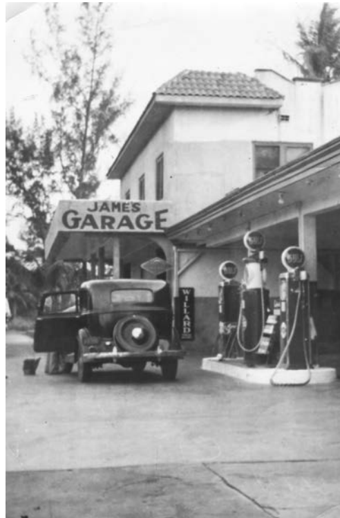
The James Garage just past Hood's Service Station, 1930s, Town of Boynton