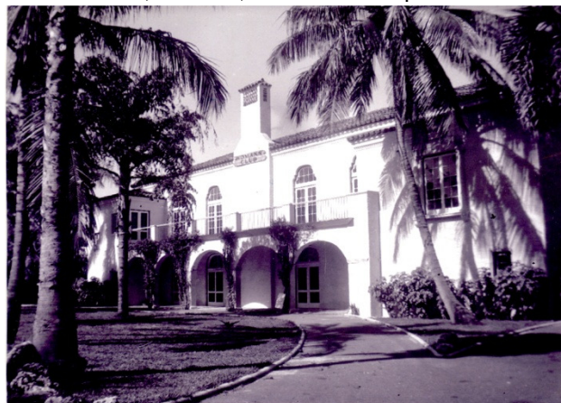
Boynton Woman's Club, ca. 1950

This is the only building in the City designed by Addison Mizner. The Boynton family underwrote the original cost for the Mediterranean style, two story structure. The Club sponsored Boynton's first public library and over the years it has been the cultural center for the City. It was the initial meeting place for several civic service organizations, church groups, political events, recitals, balls and tea parties.