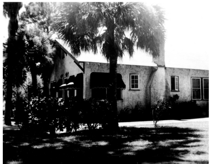
The Winchester House - early 1940s

"The CRA has been renting it for some time as their office. The original house is still behind the office, although the separate 2-car garage has been torn down. The office was added onto the front of the house by a local realtor who purchased the house from my father. The realtor (whose name escapes me at the moment) had his office there and he and his wife occupied the house."