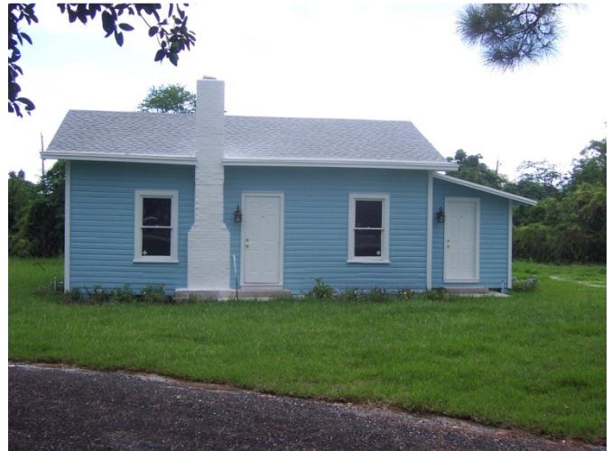
The Renovated Historic Oyer Cottage