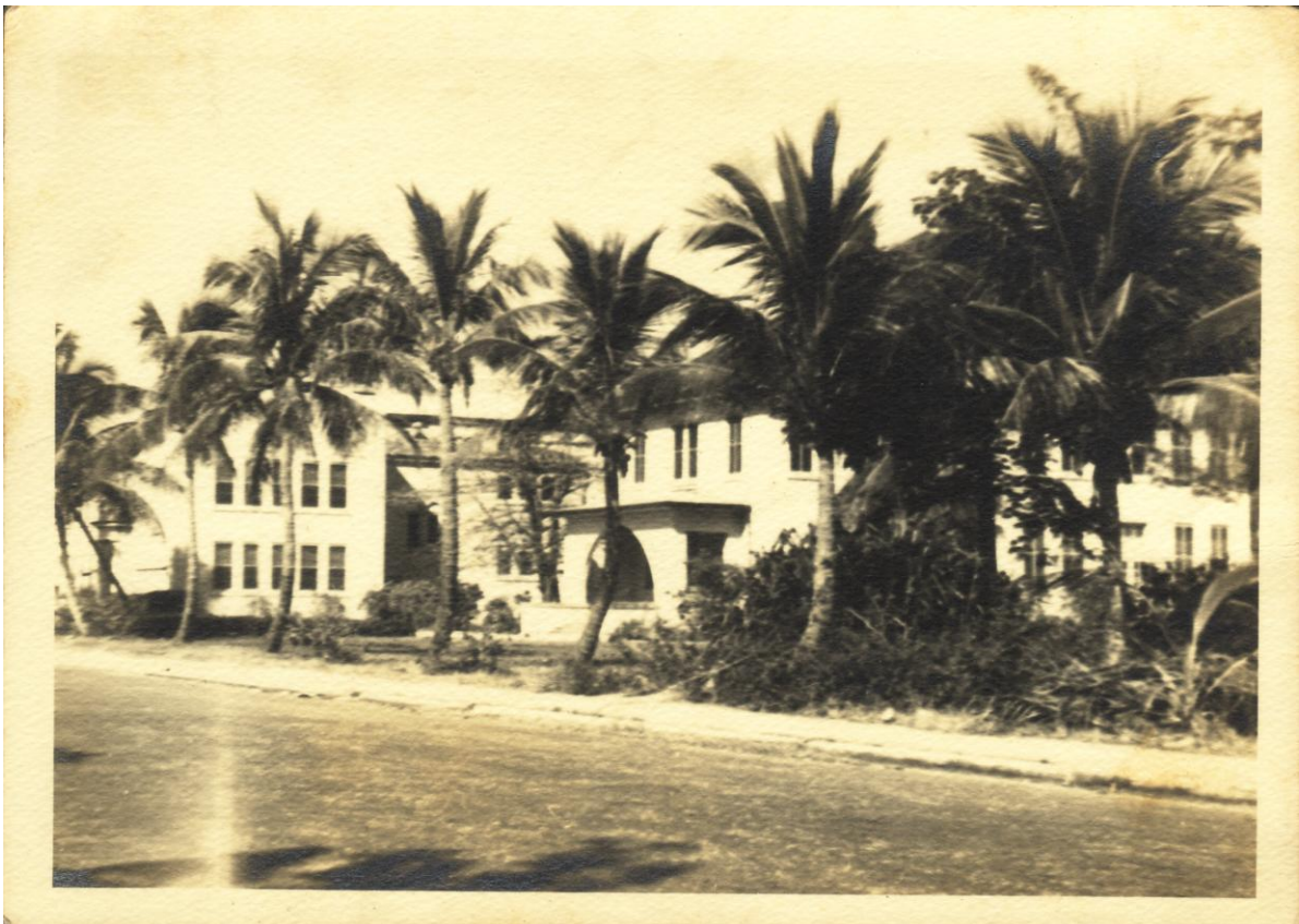
Boynton Schools ca. 1935.