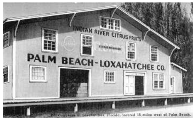
Old Packing House of Palm Beach-Loxahatchee Company

Although, as mentioned above, incorporation has been recent, the residents still consider themselves to be the oldest established western community in Palm Beach County. In 2002 they marked their 85 th anniversary with a big event which some labeled a celebration of "a rural community wanting to stay rural."