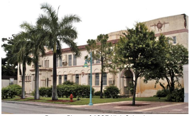
Recent Photo of 1927 High School

The question of the school was listed on the agenda for the City Commission meeting on April 15. Any action on it was postponed until May 5. Members of the Historical Society arrived after this postponement had occurred.