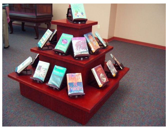
Display shelf in front of Florida stacks.

Both these shelves hold books concerning Florida, including biographies of people who have built or otherwise served the State. [Note the antique display case to the right.]