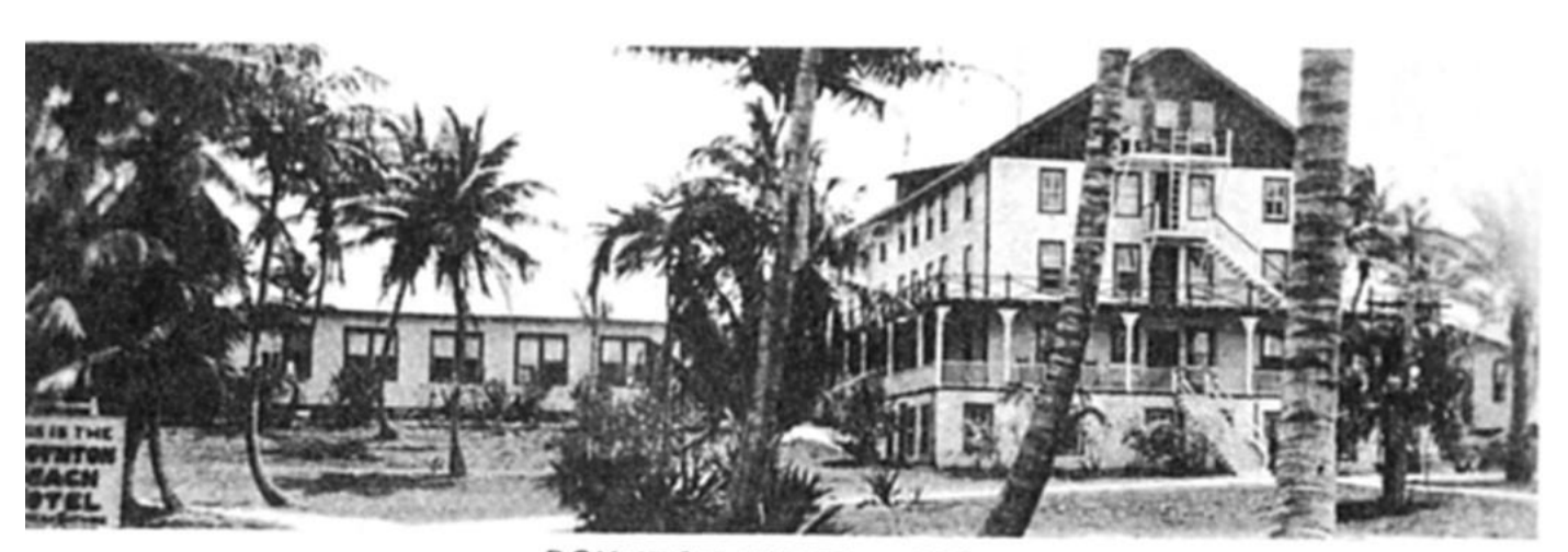
BOYNTON HOTEL - 1895

THE HISTORIAN P. O. Box 12 Boynton Beach, FL 33425-0012