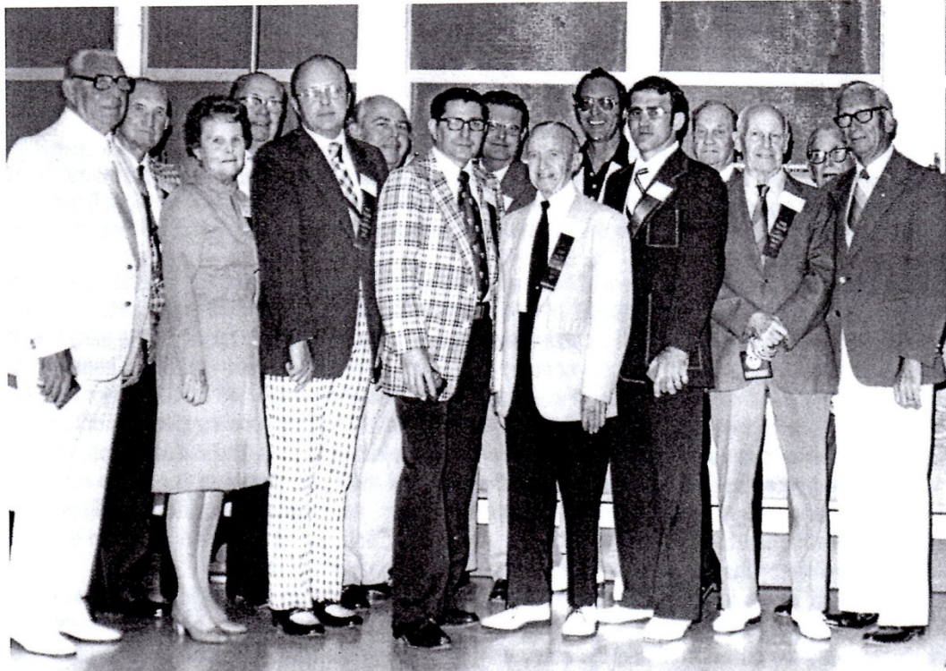
Boynton Beach City Council Meeting, March 4, 1975. How many can you recognize?