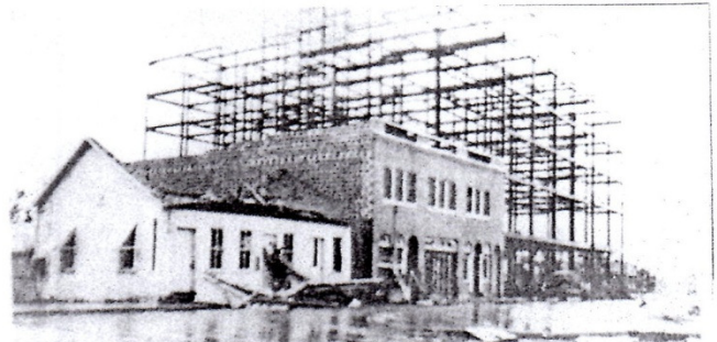
Ocean Avenue, 1928, after the hurricane.