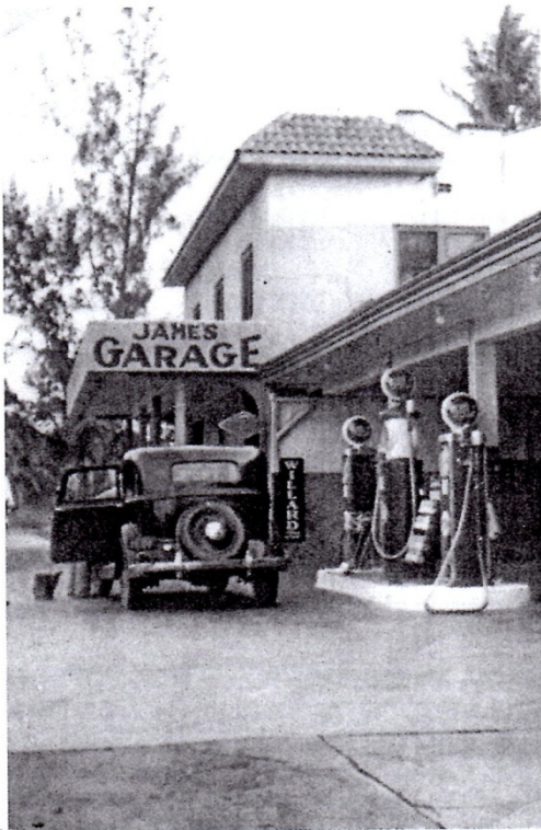
Hood's Service Station next to the James Garage 1930s. After the storm of 1928 destroyed their Tabernacle, the Boynton Methodist Episcopal Church, South used upstairs rooms in the James Garage for Sunday School classes.