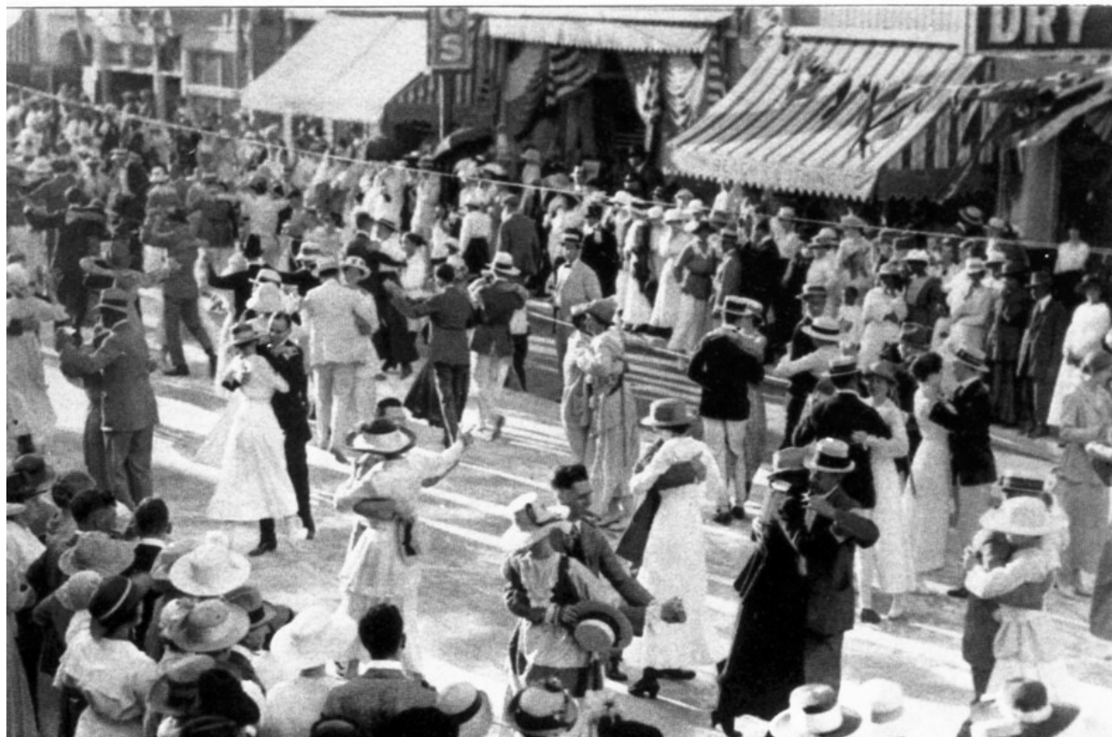
On Clematis Street, West Palm Beach 1920

We are proud to serve Boynton Beach, Ocean Ridge, Manalapan, Gulf Stream, Lantana, Hypoluxo, Briny Breezes and all areas West of Boynton Beach to U.S. Hwy 441, and on occasion, greater Palm Beach County.