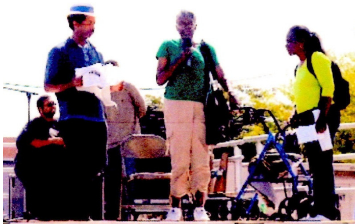
A Heart of Boynton Activity.