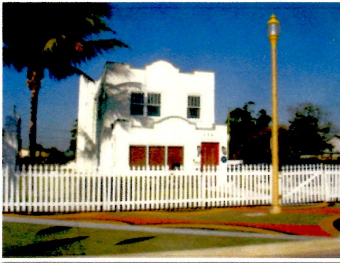
The Spady Cultural Heritage Museum

The Spady Museum is the former home of the late Solomon D. Spady who was the most prominent African American educator and community leader in Delray Beach from 1922 to 1957. His house (pictured below) is located at 170 NW 5th Avenue in Delray Beach. It is an historic two-story Mission-Revival style home completed in 1926.