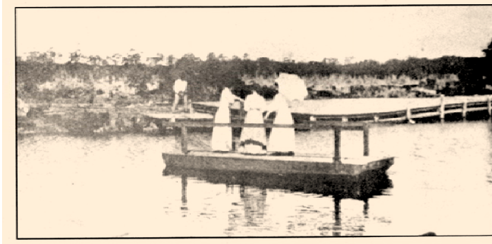
Crossing the Canal on a Lighter at Ocean Avenue