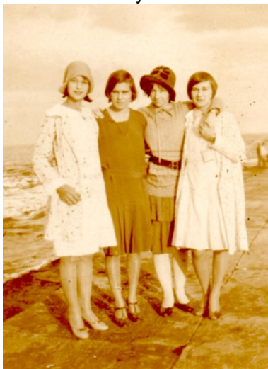
Four friends from the late 1920s