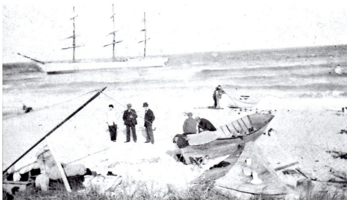
Wreck of the Coquimbo—residents, small boats in foreground

On an early morning around 5:00 in early 1909, the classically built barkentine "Coquimbo" ran hard aground about a mile south of present day Ocean Avenue. She was a large sailing ship of a kind that had prevailed during the nineteenth century equipped with two square rigged masts forward and a schooner rigged mast aft. The ship of Norwegian registry had taken on a full cargo of pine lumber at Gulfstream, Mississippi.