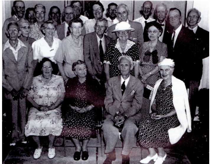
Lake Worth Pioneers - 1952