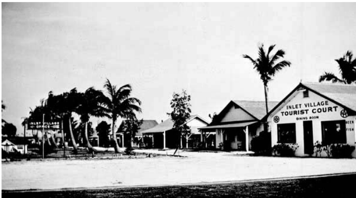
Inlet Village Tourist Court ca. 1942