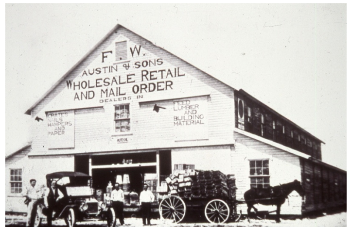
Austin and Sons, later Austin Supply