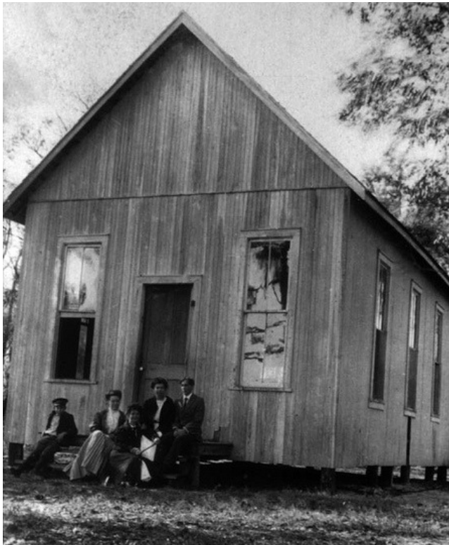
Lantana First School, Foot of Osborne Road 1893-1908

Below are some selected pictures from that collection: