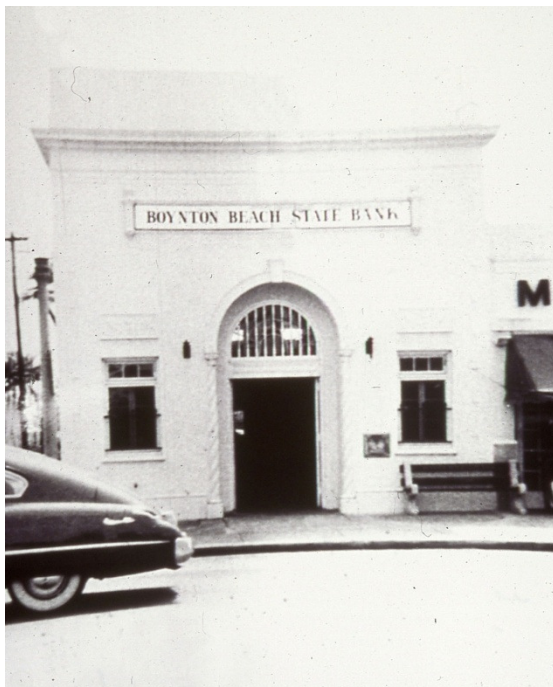
Boynton Beach State Bank—US 1 and Ocean Avenue