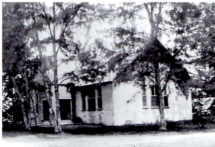
The 1908 Boynton Methodist-Episcopal Church, South, where the bell from the Coquimbo was originally installed.

The ship's bell was reported to have been installed in the steeple of the First Methodist-Episcopal Church, South, which stood at the corner of Ocean Avenue and Federal Highway. When that building was razed in 1925, the bell was relocated. Some reports suggest it was given to another church, either to St Cuthbert's Episcopal Church or to St. Paul's AME Church, both located on Martin Luther King Boulevard.