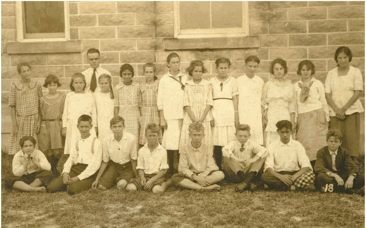
Boynton School – 6 th , 7 th , and 8 th grades 1921. Can anyone identify anyone?

We are proud to serve Boynton Beach, Ocean Ridge, Manalapan, Gulf Stream, Lantana, Hypoluxo, Briny Breezes and all areas West of Boynton Beach to U.S. Hwy 441, and on occasion, greater Palm Beach County.