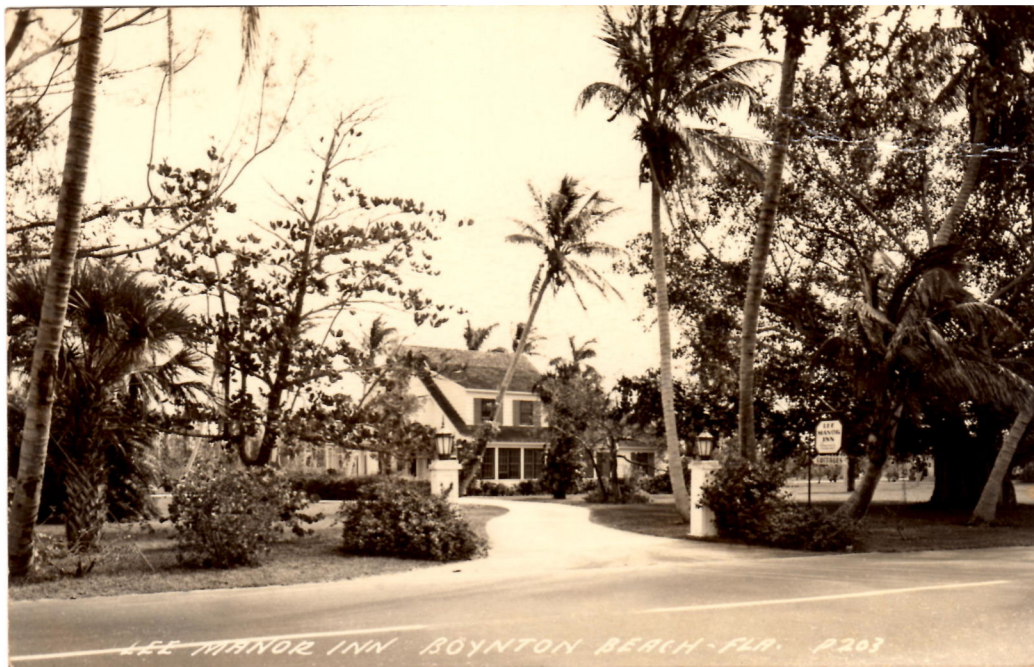
A picture postcard of Lee Manor Inn on South Federal Highway, probably taken in the 1950s. Note the trees, the entrance columns, the absence of sidewalks and curbs. Federal Highway was later widened and the entrance to the inn changed considerably. Currently the building still stands, now used as a consignment shop.

We are proud to serve Boynton Beach, Ocean Ridge, Manalapan, Gulf Stream, Lantana, Hypoluxo, Briny Breezes and all areas West of Boynton Beach to U.S. Hwy 441, and on occasion, greater Palm Beach County.