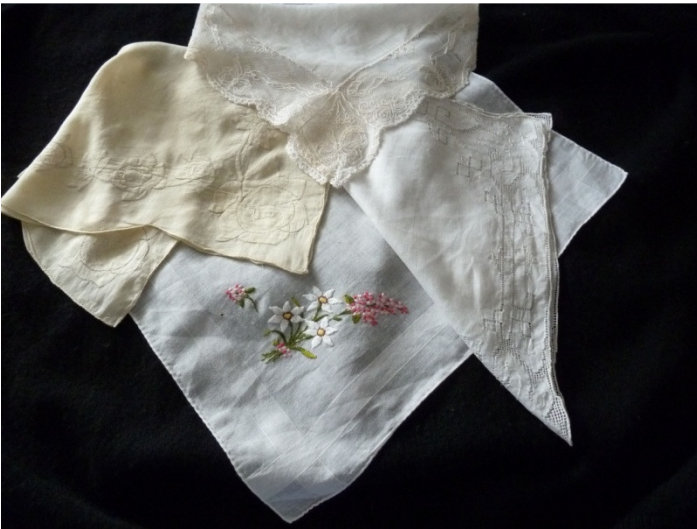
Embroidered and appliquéd ladies handkerchiefs

While I was stowing away some Christmas linens in an old cedar chest, I came across a bag of lovely linen handkerchiefs that had belonged to my mother. What nostalgia they evoke. The ones Mother had saved showed techniques of stitchery I am unable to name. Embroidery, applique and fancy open stitching were never my forte, although Mother tried periodically to strengthen my skills by buying me a small stamped doily or a chair back or chair arm cover to complete to try to stimulate my interest. I might work part of an hour one day and leave the remainder for Mother to finish months later. Mother never learned to tat which is to make lace by hand, however. The handkerchiefs or scarfs adorned with this complex handcraft were left to the skilled fingers of my great aunts. Thus, to my considerable relief, I was spared efforts to teach me tatting since I saw these aunts only occasionally.