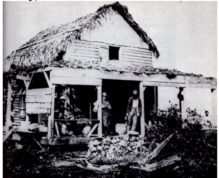
The Pierce home on Hypoluxo Island was built in 1876 from lumber and driftwood salvaged from the beach. H. D. Pierce is leaning against the doorway on the right

On page 6 in the April Historian we included the following picture: