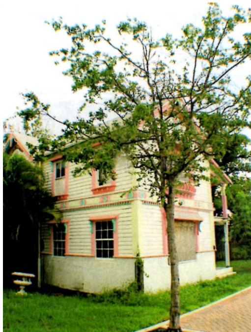
The Daugharty House at 405 East Ocean Avenue as it looked in 1907 before it was demolished.