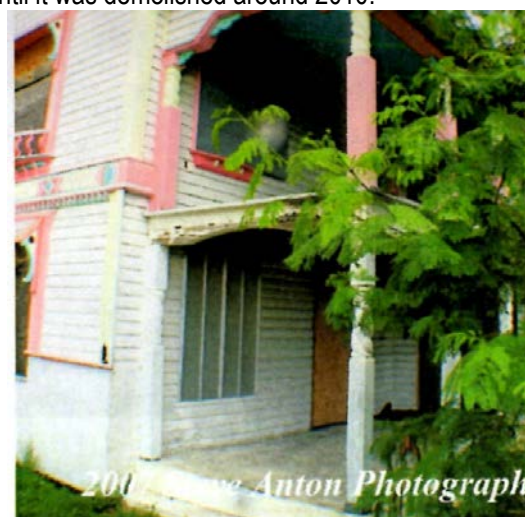
East side of the Daugharty House in 2007

In the 1990s Robert Katz bought the house with the intention of leasing it for a restaurant. He died before he accomplished little more than painting the trim. The building sat idle for a number of years until it was demolished around 2010.