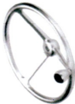
Steering wheel with steering knob

STEERING KNOBS – AKA “Suicide knobs” and “Necking knobs” they were attached to the steering wheel and made it easier to drive with one hand, thought to be especially useful on a date.