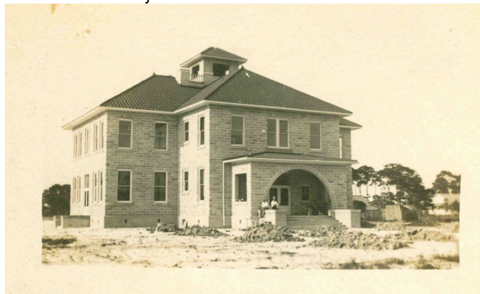
The Boynton School, ca. 1913