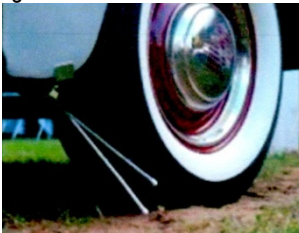
Curb feelers and White Side Walls

CURB FEELERS – an antenna like extension attached to the body of the car next to the tire (usually white-walled) which made a scraping noise if the tire was in danger of being scarred by coming too close to the curb during parking.