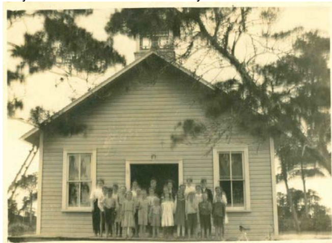
1st Permanent Schoolhouse in Boynton, ca/ 1907