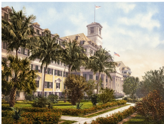
Hotel Royal Poinciana