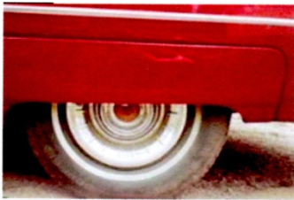
A fender skirt

FENDER SKIRTS – attached by clips to the fender in front of the tire to provide a more streamlined look (a real nuisance if one had to change a tire!)