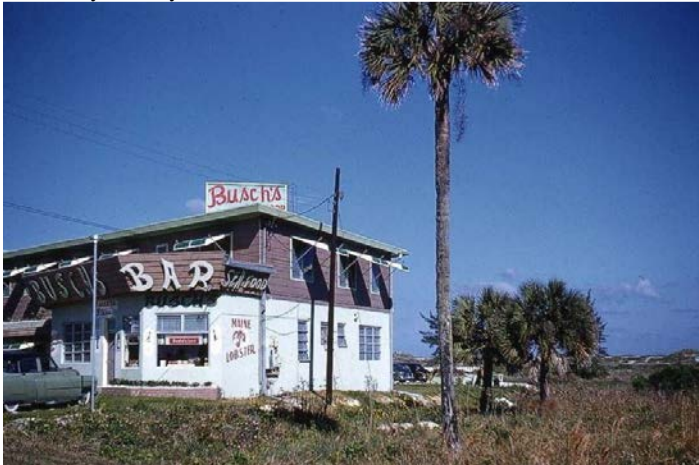
Busch's Seafood on A1A , a wooden building closed in 1992 when the Town of Ocean Ridge refused to renew their license because of a new Town policy prohibiting commercial establishments within the town limits. Famous for lobsters, stonecrabs and Key lime pie recalled fondly by many former patrons.

Here are some of the pictures taken directly from the Facebook site that you may not have seen: