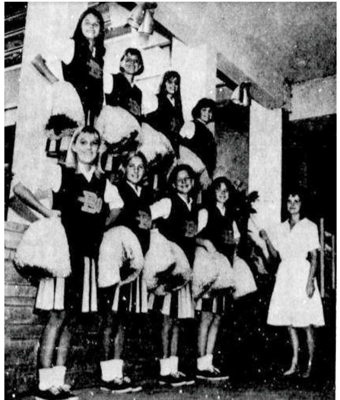
Boynton Junior High School Cheerleaders ca 1966 Can you send us the names of any of them?

ALL PROGRAMS OF THE SOCIETY ARE FREE TO THE PUBLIC