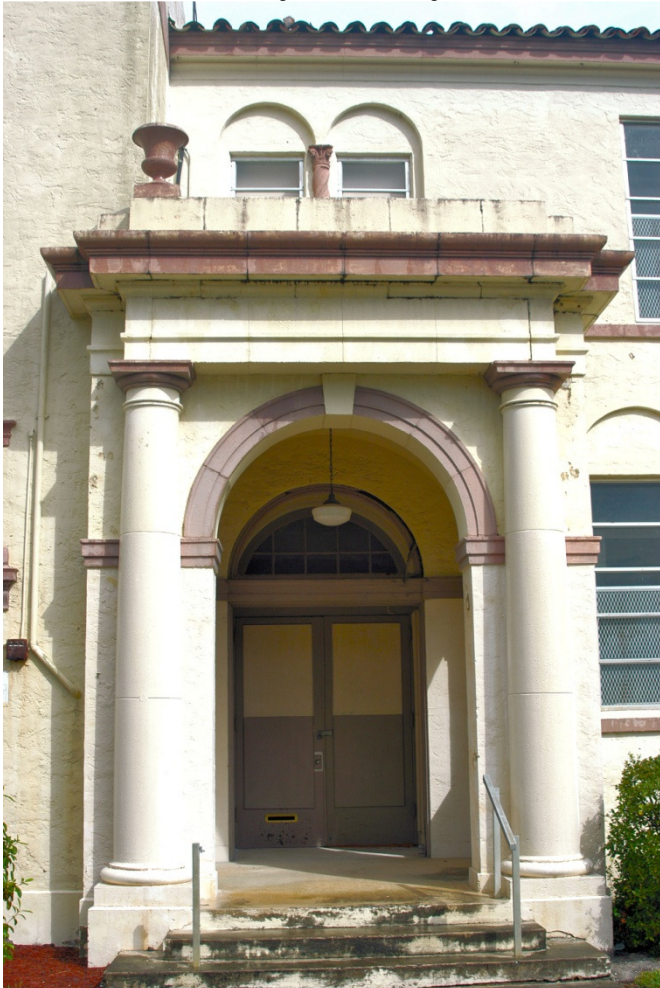
West front entrance showing barrel tile roof, urn and columns

According to a 2011 report, the building is in fair condition, but needs repairs to the roof, flooring, interior plasterwork, and electrical, plumbing and mechanical systems. Hazardous materials need to go, too, and the interior needs a good disinfecting.