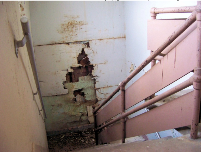
West rear stairwell showing damage

Fans of urban explorer websites would have a field day exploring the grounds of the school. The basketball hoops are still there, as are a couple of pull-up bars, bolted into the wall, and a pair of hand-shredding ropes that dangle from the ceiling. But the long-shuttered, 86-yr-old Boynton High School also contains calling cards from a squad of unwelcome visitors—humans, humidity, pigeons and plain old age.