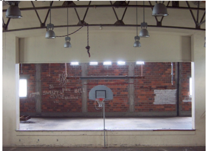
2nd Floor Gymnasium showing stage and basketball hoop

The school opened for senior high classes in 1927, and served as a shelter during the great hurricane of 1928. Many residents took refuge in the building, and some were injured when the second-floor gymnasium gave way. King oversaw the repairs.