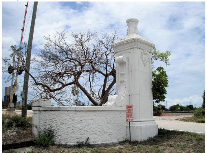
One of the original entrance gates to Lake Boynton Estates. The other is no longer standing. The City's Historic Preservation Board is considering how to conserve this one.