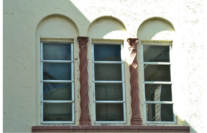
Art Deco detail – triple windows with columns