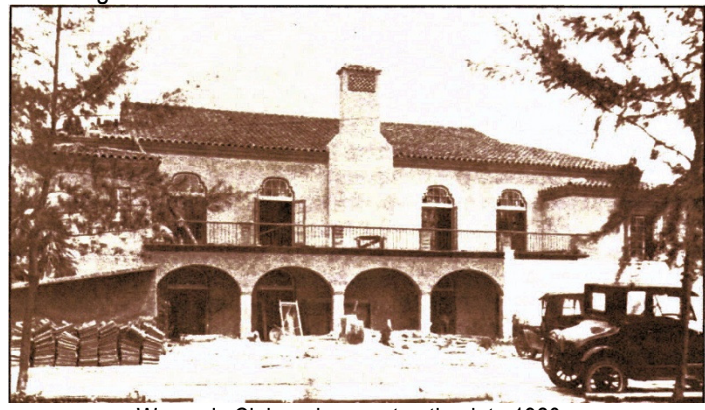
Woman's Club under construction late 1920s

Boynton died quietly in Port Huron in the summer of 1911. Hailed as "father" of the Order of the Knights of Maccabees, an organization he'd wanted to bring to Boynton, too, he also was remembered for inventing the Boynton Fire Escape, Boynton Hook and Ladder Truck, and fire-fighting systems. But he's probably best remembered in Florida, where his sole memorial stands. It's not the hotel—that was razed in 1925 to make way for a bigger and better one that hurricanes and the Great Depression cancelled. It's the Boynton Woman's Club building, started via a donation of $35,000 from the Major's four (of six) remaining heirs in 1925.