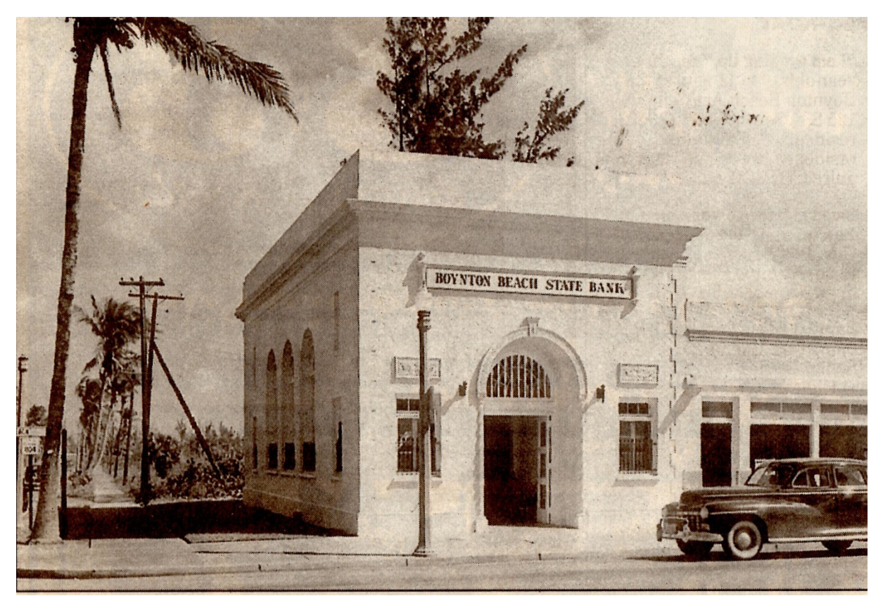
The Boynton Beach State Bank stood on the southeast corner of Ocean Avenue and Federal Highway. Note the street light in the foreground and the wooden light poles on the left. When Federal Highway was later widened, part of the bank lot became part of Federal Highway. All the buildings shown were razed and new ones erected farther east as development also occurred in the areas behind the bank

Che ACistorian Boynton Beach Historical Society Post Office Box 12 Boynton Beach, FL 33425-0012