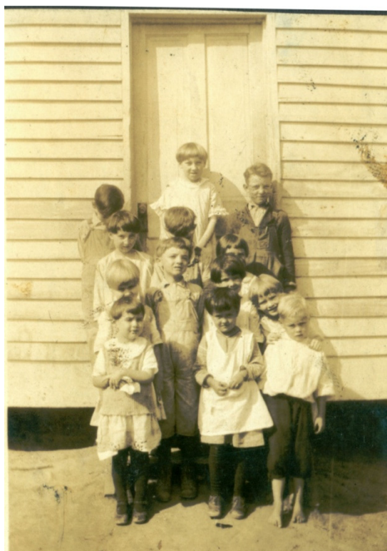
School children at the early Boynton elementary school before the 1913 schoolhouse was built.

Boynton Beach Historical Society Post Office Box 12 Boynton Beach FL 33425-0012