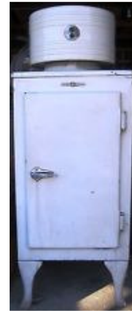
1930s GE Monitor Top Refrigerator

The name "ice box" was in such common usage that, as electric refrigerators came into use, people continued to use the term "ice box" to refer to them. Regardless of the make of the electric refrigerator, if they were not called ice boxes, they were called "frigidaires," "Frigidaire" for many years was a generic term much like the words "Thermos" and "Kleenex" became.