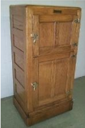
An antique ca 1890 icebox shown on Ebay website

Ice was stored in the "ice box," usually a wooden cabinet with two or more doors.