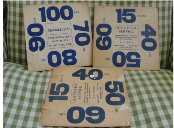
Ice Delivery Cards

The customer who wanted delivery placed an "ice card" in a window to indicate a wish for delivery and the amount desired. The size of the ice block was indicated by the "up" number at the top of the card.