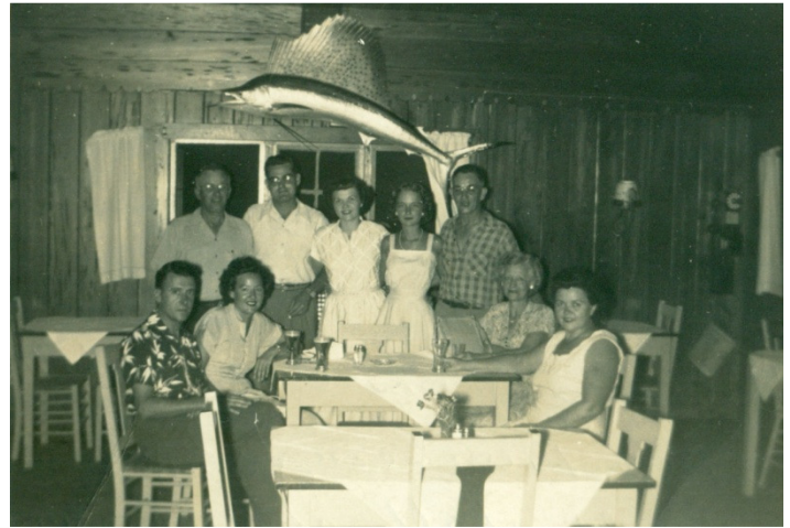
Guests at tables in restaurant ca. 1950. Can you help us identify any of them?