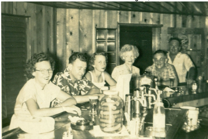
Guests at the bar ca. 1950. Can you help us identify any of them?