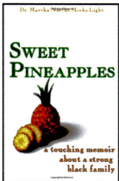
The Book Cover