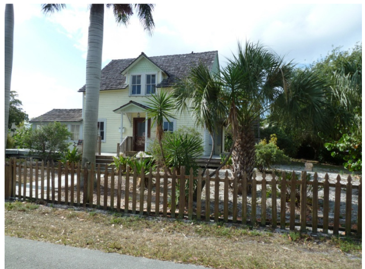
The Andrews House in 2015.

"Completely surrounding the historic renovation of Boynton's oldest house will be carefully orchestrated landscaping with cocoplum, slash pines. Pineapples, fruit trees and palmettos expensively recreating native Florida to allow visitors to complete their experience of a day in the lives of Boynton's earliest pioneers."