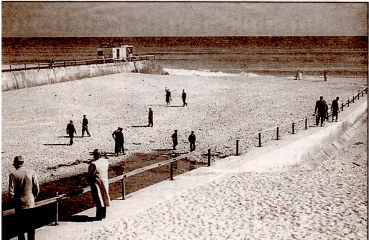
A few years ago the South Palm Beach Inlet, better known as the Boynton Inlet, was filled with sand due to erosion as this photograph indicates. The woman waving near the upper center is Lorraine Eagan.

Boynton Beach Historical Society Post Office Box 12 Boynton Beach FL 33425-0012