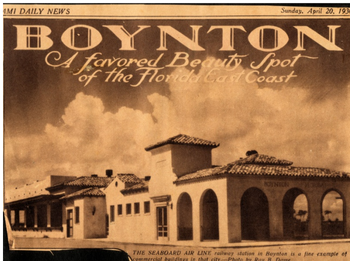
A 1930 photo from the Miami Daily News showing the relatively new Seaboard Railway Station. This beautiful building was torn down a few years ago and had stood just south of west Ocean Avenue in an area that was blocked off when I-95 was created. It was one of two train stations in Boynton. The other, was for a different rail line, the Florida East Coast, whose station was also just off Ocean Avenue but west of the Oyer buildings housing their insurance offices and Hurricane Alley restaurant.