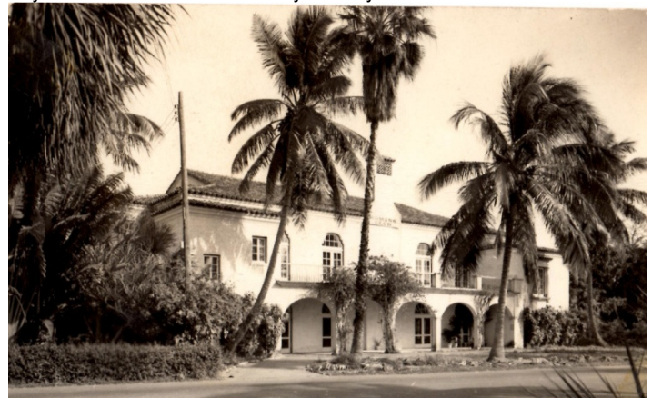
From a postcard, the Boynton Womans Club as it looked about 1950. Note the curving driveway which goes in front of the porch, the coconut palms, and the absence of a curb along Federal Highway which runs in front of it. Few coconut palm trees remain anywhere in southeast Florida. Most have died from a disease commonly named "lethal yellow." Federal Highway has since been widened and the Club lost a part of its street front footage.