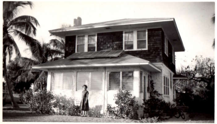
The Methodist Parsonage with minister's wife Nona Roy standing before it in January 1957. It stood facing Seacrest Boulevard on the block where City Hall is now located. The old First Baptist Church, a frame structure with wooden shutters for windows, stood behind it.