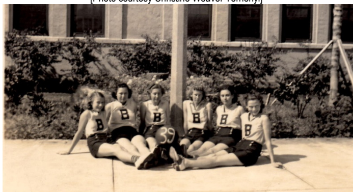
Boynton High School Tigerettes 1939 Can anyone send us their names?