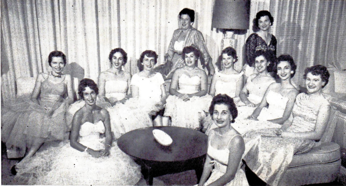
The Committee Chairs for the Junior Follies of 1959

Below are some pictures taken of the cast members in costume. Perhaps some of our readers can put the right names with the right people in these photographs. We list those we believe to be pictured, but we are not sure which individuals they represent.