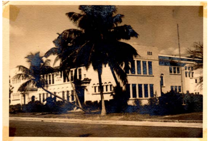
Boynton High School, c. 1948