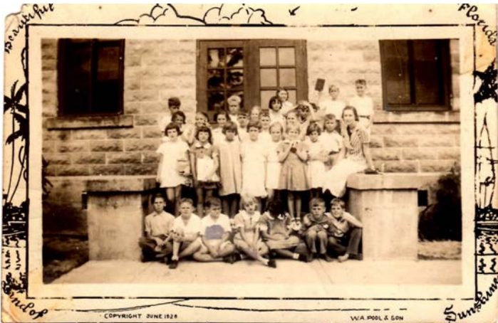
An elementary school class posed at one of the side entrances of the 1913 schoolhouse c. 1935