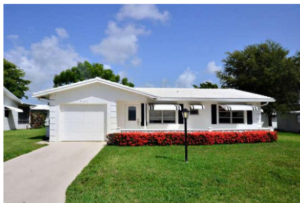
A Typical Leisureville Home