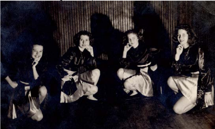
Boynton High School Cheerleaders, c. 1948