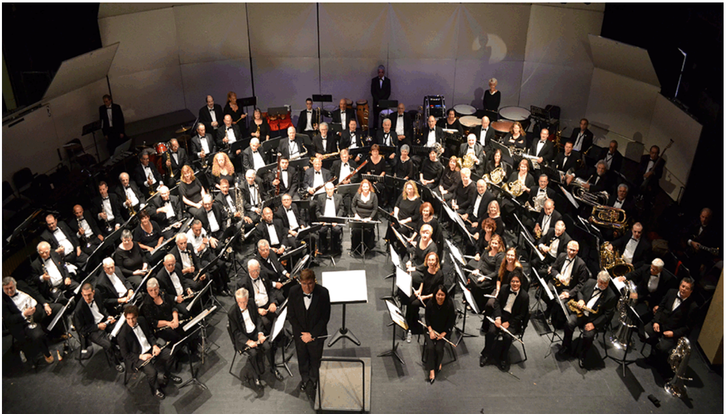
The Gold Coast Band

Boynton Beach Historical Society Post Office Box 12 Boynton Beach FL 33425-0012