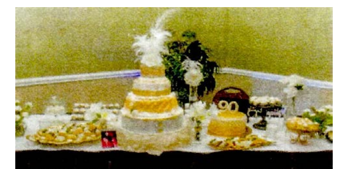
90th Birthday Celebration