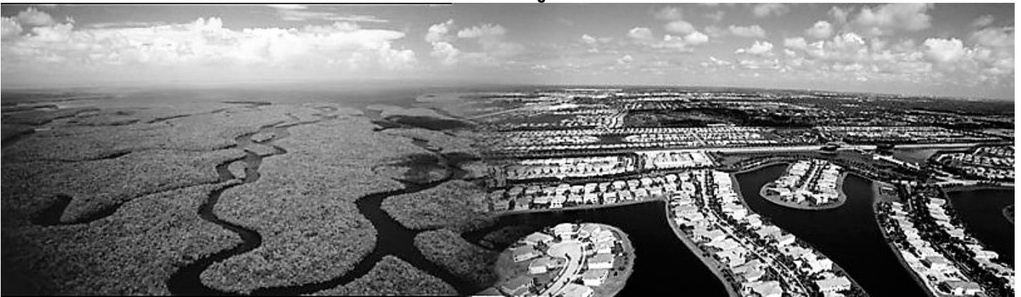
Everglades – merged