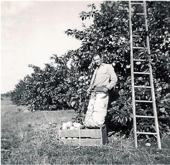
Clarence Shelton at Knollwood Groves. He probably did not wear a dress shirt and tie when he actually worked in the groves.