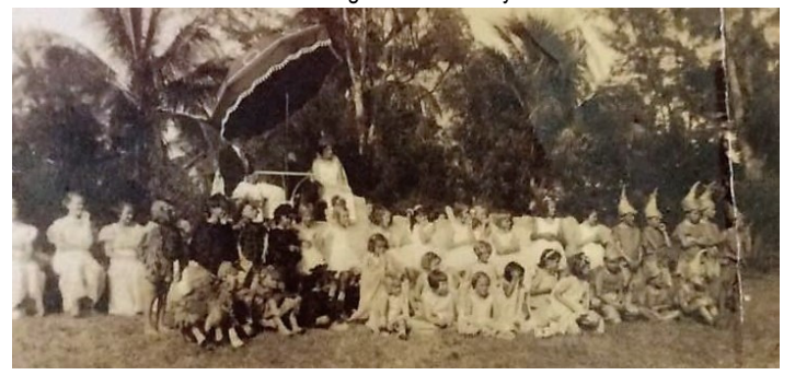
The May Day Court In the Court picture the children with the peaked caps on the right are the first grade boys who were elves; the little first grade girls are seated

center right and were butterflies. Some costumes were made by mothers or friends, and some representing countries of the world were rented. Each group had a little dance to perform, and we all sang in