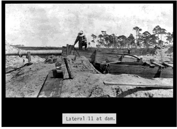
LW Drainage District constuction of an early dam

Some pictures relative to program on LW Drainage.