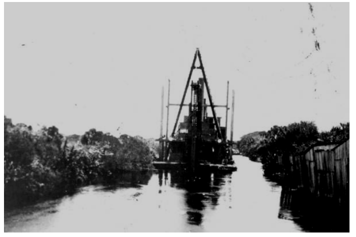
A Dredge on Boynton Canal