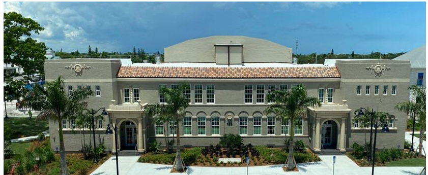
Left: Children's Schoolhouse Museum and Learning Center, courtesy Photographer South Florida via Flickr. Right: Boynton Beach Arts & Cultural Center, courtesy City of Boynton Beach