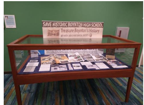
Left: Save Historic Boynton High Rally, July 2016; Right: Boynton Beach City Library Display, June 2022.