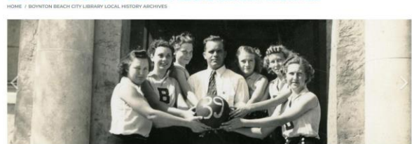
The mission of the Boynton Beach City Library Local History Archives is to collect, preserve, and make accessible the heritage of the people of our region.