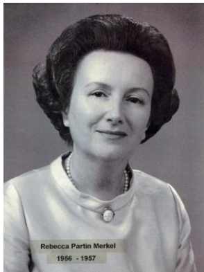
One of the Boynton Woman's Club presidents, 2019.003.

Here are more notable donations made to the Local History Archive in 2019. We look forward to building our collections in our new building and continuing to preserve and provide access to historical materials of our region.